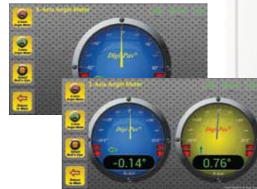
Single & Dual-Axis Angle Meter, view on smartphone or tablet screen using Digi-Pas® Level Mobile Sync Apps

This feature enables user to view single-axis or dual-axis angle/levelling measurement in numerical and graphical display i.e. degree, mm/M & In/Ft. units.